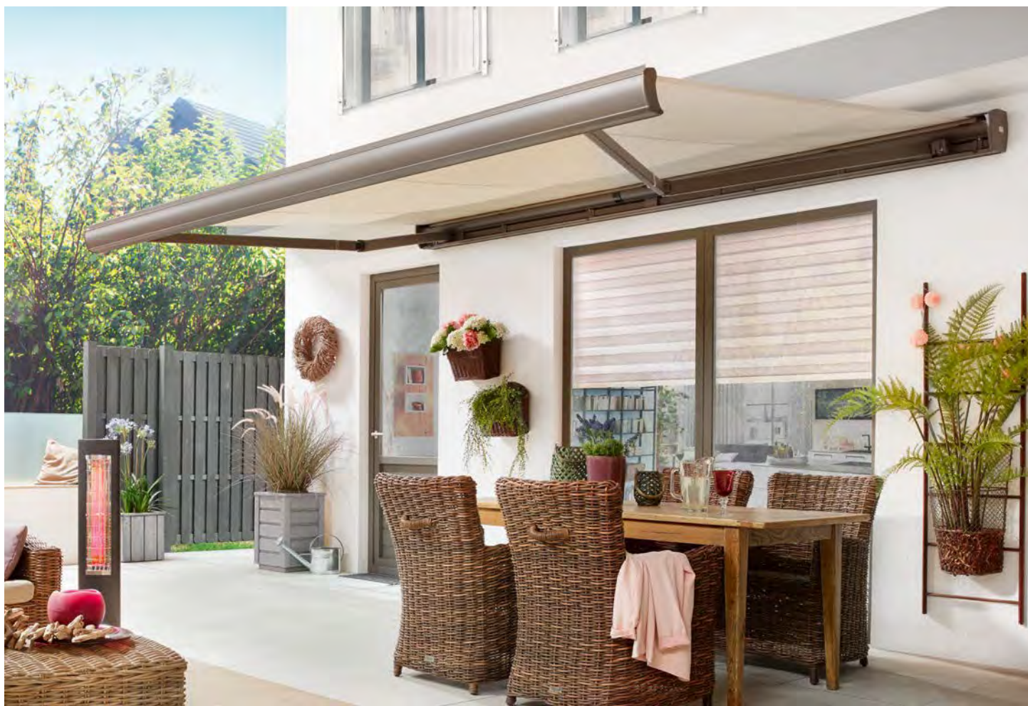
Compact design with a high degree of comfort and superb technical features.

Classic design, superior quality, ease of operation and high value retention: the Family Compact combines the protective function of a cassette awning with the ease of installation of a back bar awning.