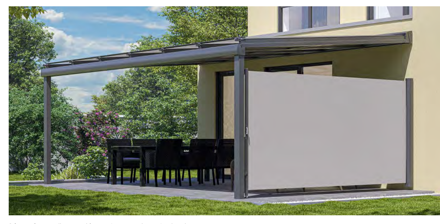
Private refuge – well protected from prying eyes and annoying draughts.

The Micro 700 forms the perfect complement to a glass roof or awning (shown here with Murano Integrale glass roof from Lewens).